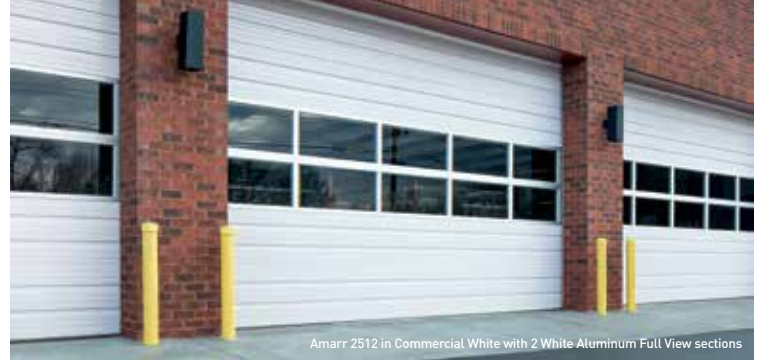
Amarr 2512 in Commercial White with 2 White Aluminum Full View sections

These open-back commercial steel doors are available in a variety of steel gauges and feature tongue and groove construction with a bottom weather seal to guard against the elements. These doors can be factory- or field-modified with CFC-free polystyrene insulation to fit the needed application.