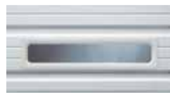
24" X 6" DSB or PLEXIGLAS®