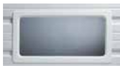
24" X 12" SINGLE PLEXIGLAS® 24" X 12" INSULATED PLEXIGLAS®

Available with either a black or white frame.